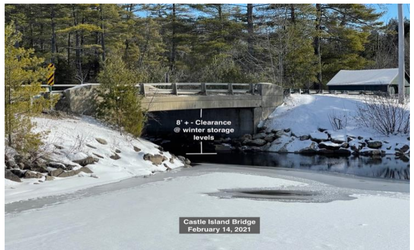
Dick Greenan, Secretary Belgrade Area Inter-local Dams Committee

In the middle of the summer when Long Pond is at full pond (ie. water is just barely going over the spillway at the Wings Mill Dam) there is just 6.5' of vertical height clearance. With a heavy rain event and/or Spring melt, the water can easily come up 10-12" so obviously you're down to just 5.5' of clearance. And around Labor Day, you can plan on having at least 10-12" additional clearance, or around 7.5'. Obviously, these guidelines are just estimates due to the variables.